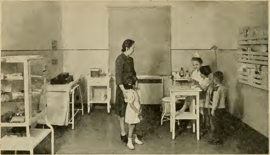
Young visitors to Freeman Clinic, El Paso, seem to enjoy the nurse's attention